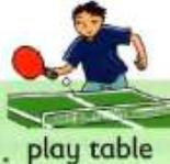
play table tennis